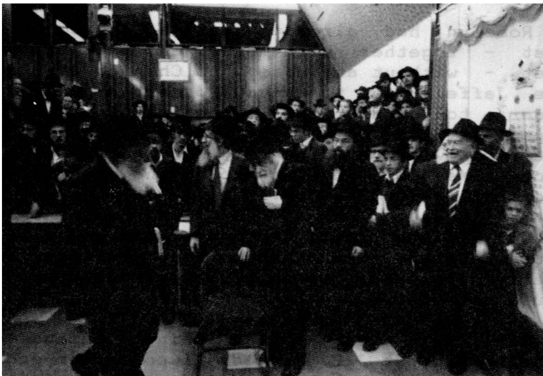
(The Rebbe strides towards the Ark.

been taking place regarding the ownership of the Lubavitch Library.