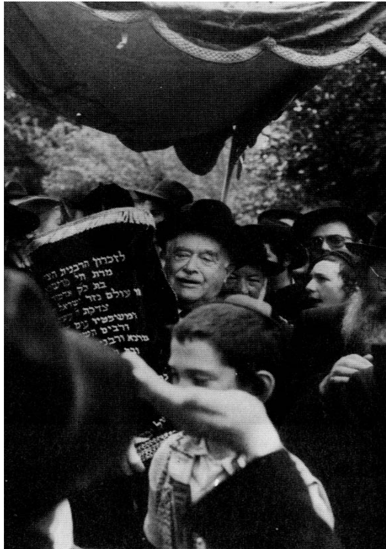
I take part in the procession. The mantle was made at the Crown Heights, with a special inscription. I bought it back with me after Shovuos.