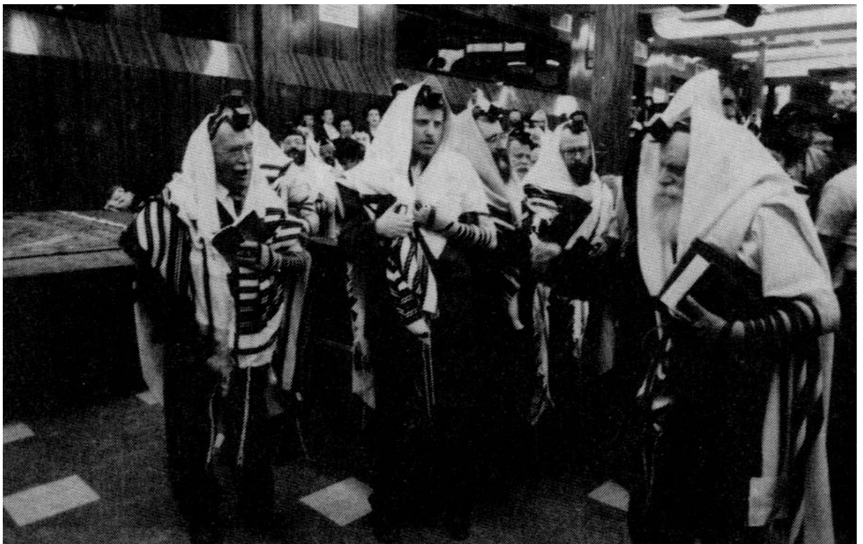
We welcome the Rebbe to the Morning Service.

Therefore they read from it for the very first time at the morning service at 770, and the Rebbe had his usual (the 3rd) Aliya. The Song - Sissu Vesimch U-Besimchas Torah - was sung with liveliness and excitement.